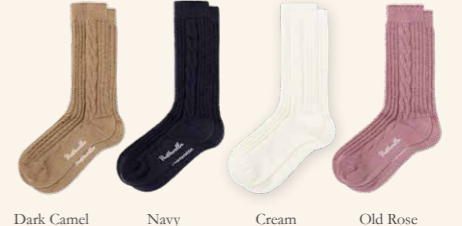
Dark Camel Navy Cream Old Rose