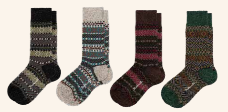
Anthracite Fleck 04 Natural Fleck 05 Dark Brown Fleck 06 Racing Green Fleck 07