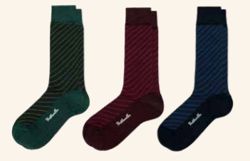
Tartan 01 Maroon 02 Navy 03