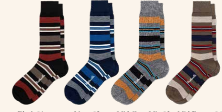
Black 01 Navy 02 Mid Grey Mix 03 Mid Brown 04