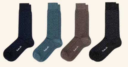
Navy 01 Teal 02 Mole 03 Charcoal 04