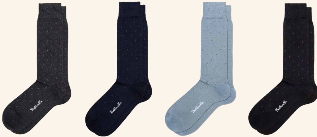
Dark Grey Mix 01