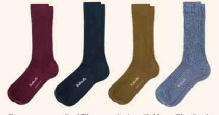
Beetroot Steel Blue Antique Gold Blue Smoke