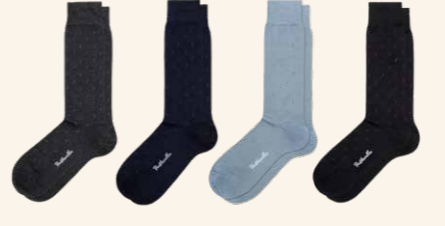
Dark Grey Mix 01 Navy 02 Blue Mist 03 Black 04