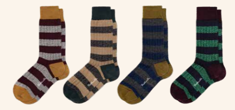
Maroon 01 Dark Camel 02 Mid Grey Mix 03 Navy 04