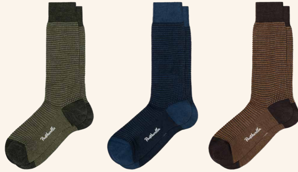
Dark Olive Mix 16