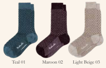
Teal 01 Maroon 02 Light Beige 03