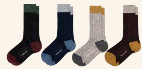
Anthracite Fleck 13 Navy Fleck 14 Natural Fleck 15 Dark Brown Fleck 16