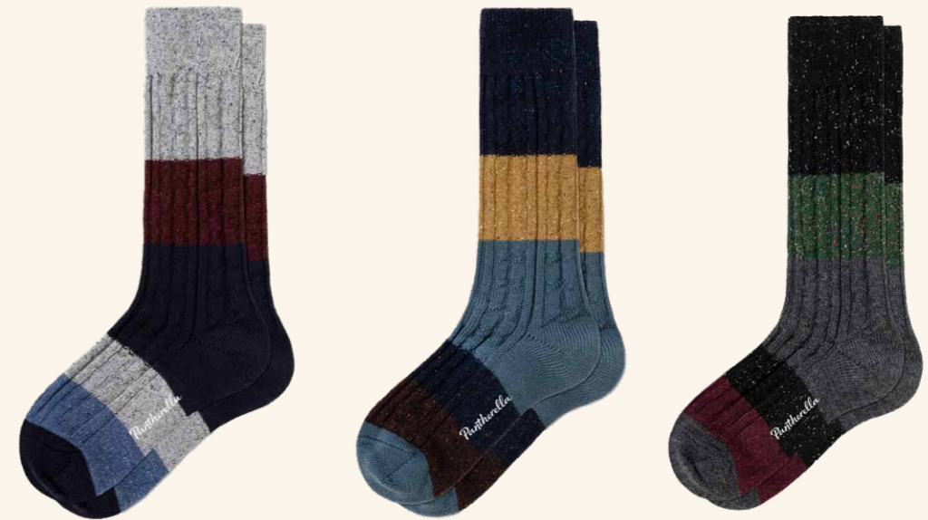
Mid Grey Fleck 04