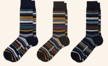
Navy 01 Dark Brown Mix 02 Black 03