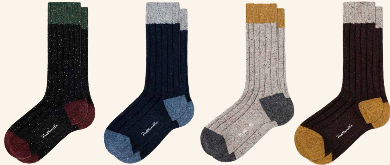
Anthracite Fleck 13