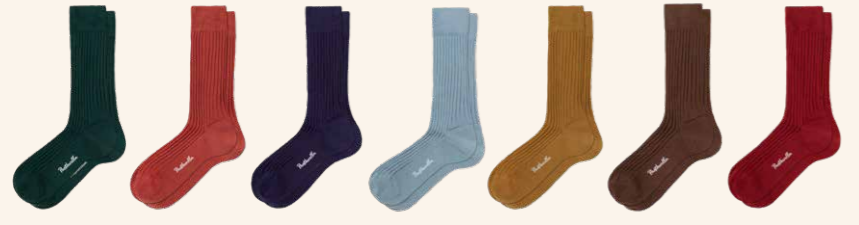
Tartan Terracotta Blackberry Blue Mist Old Gold Conker Royal Red