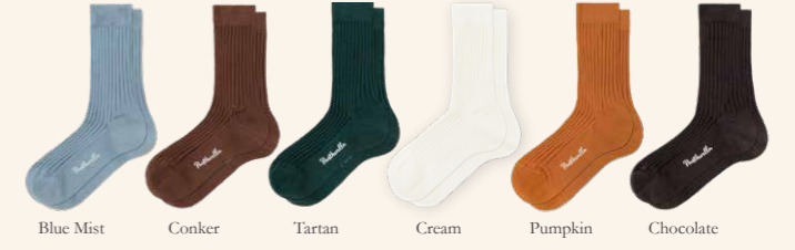
Blue Mist Conker Tartan Cream Pumpkin Chocolate