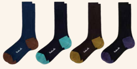
Dark Blue 248 Navy 249 Chocolate 250 Black 251