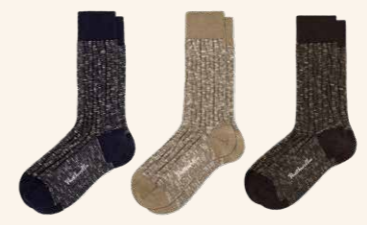
Navy Mix 01 Dark Camel Mix 02 Dark Brown Mix 03