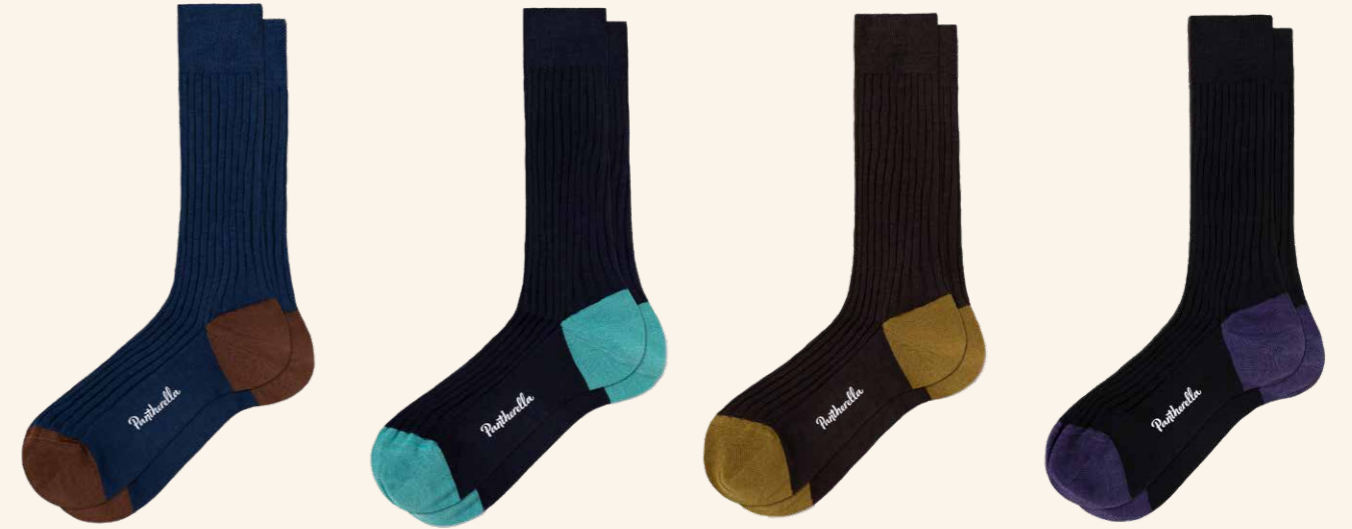
Dark Blue 248