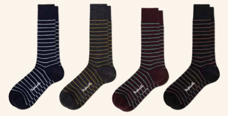
Navy 05 Charcoal 06 Maroon 07 Black 08