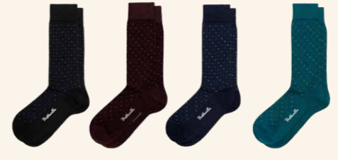
Black 01 Burgundy 02 Navy 03 Peacock 04