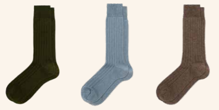
Dark Moss Ash Blue Hazelnut