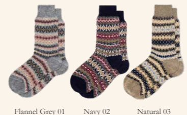
Flannel Grey 01 Navy 02 Natural 03