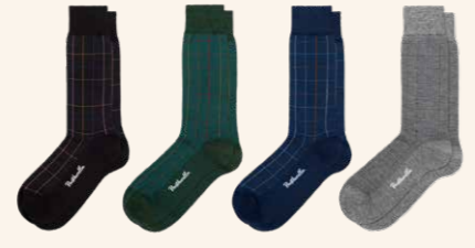
Black 01 Bottle Green 02 Navy 03 Mid Grey Mix 04