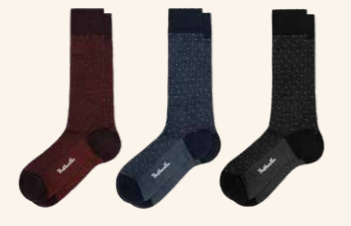
Maroon 01 Navy 02 Black 03