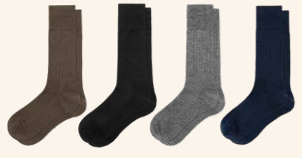
Mid Brown Black Mid Grey Mix Navy