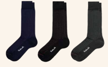
Navy 01 Black 02 Dark Grey Mix 03