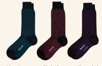
Navy 01 Black 02 Charcoal 03