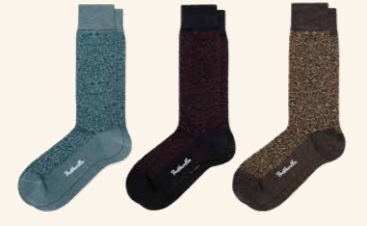
Teal 01 Black 02 Dark Brown Mix 03