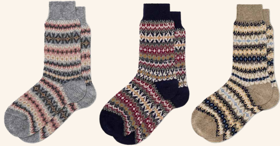
Flannel Grey 01