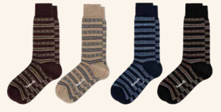
Maroon 01 Dark Camel 02 Navy 03 Black 04