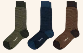
Dark Olive Mix 16 Dark Blue 17 Chocolate 18