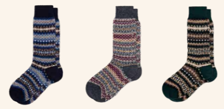
Navy 01 Dark Grey Mix 02 Racing Green 03