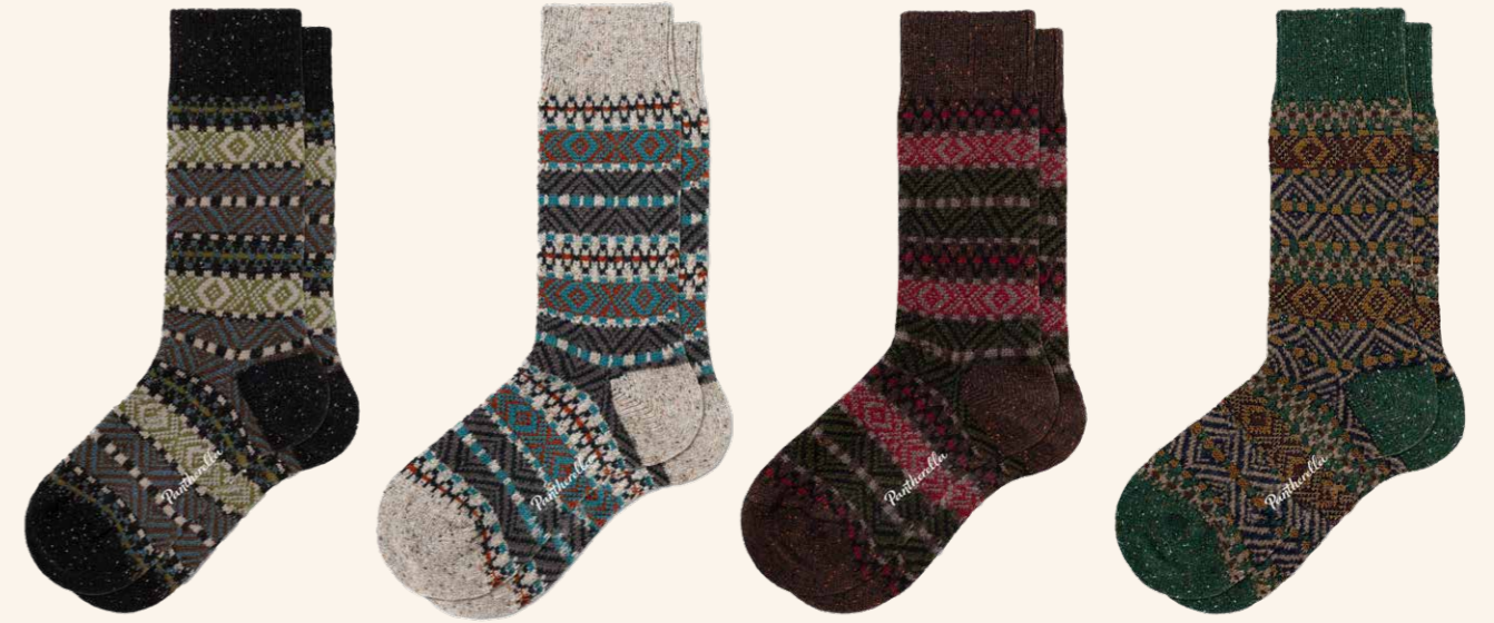
Anthracite Fleck 04