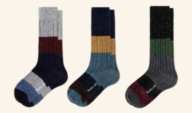
Mid Grey Fleck 04 Navy Fleck 05 Anthracite Fleck 06