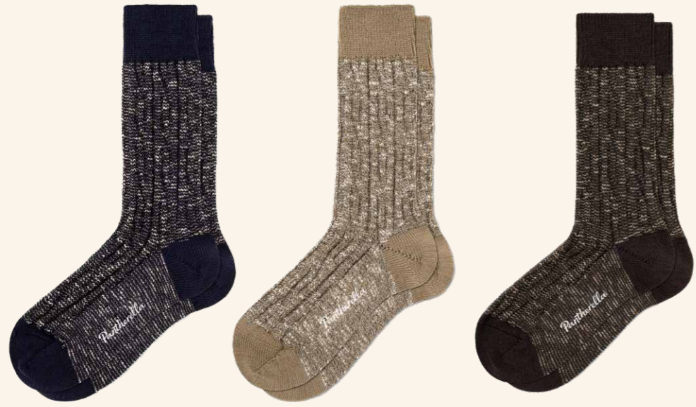
Navy Mix 01