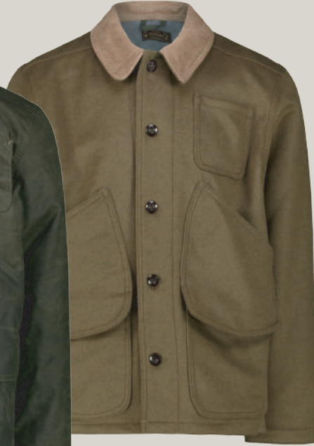
WOOL - ARMY GREEN

MOD: STOWE HUNTING JKT 110,00 € | 329,00 € FABRIC: "HALLEY STEVENSONS" COTTON WAXED COLOURS: DEEP OCEAN - ARCHIVE GREEN - BROWN SIZES: X-SMALL TO 3X-LARGE