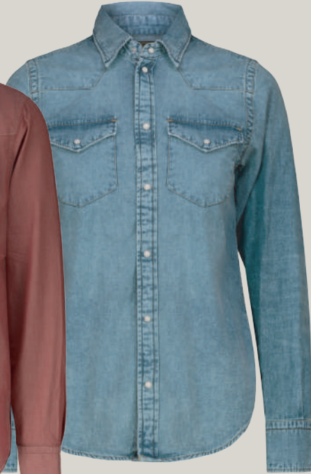
DENIM / 3 YEARS