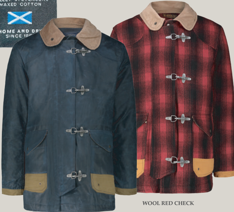
WAXED DEEP OCEAN