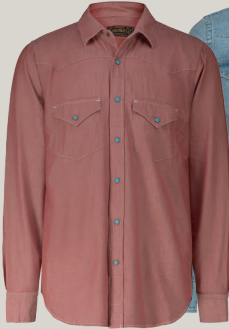
RED / CHAMBRAY