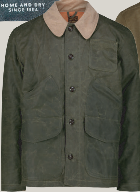
WAXED - ARCHIVE GREEN